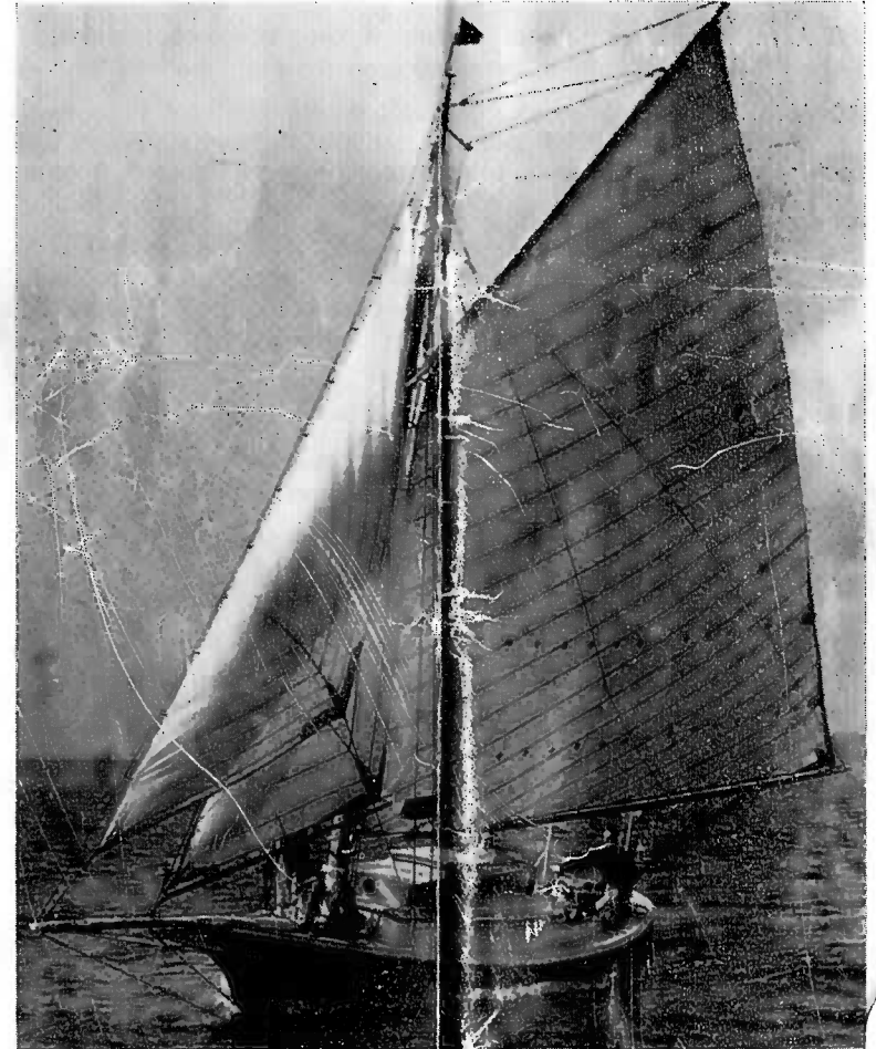
FRIENDSHIP, MAINE — THE HOME OF THE SLOOP